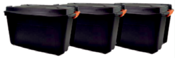
45lt MAGYVER BOX R89.90 EACH | sc86729